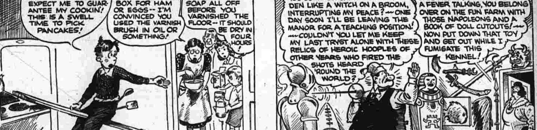
OUR WAY BY J. R. WILLIAMS