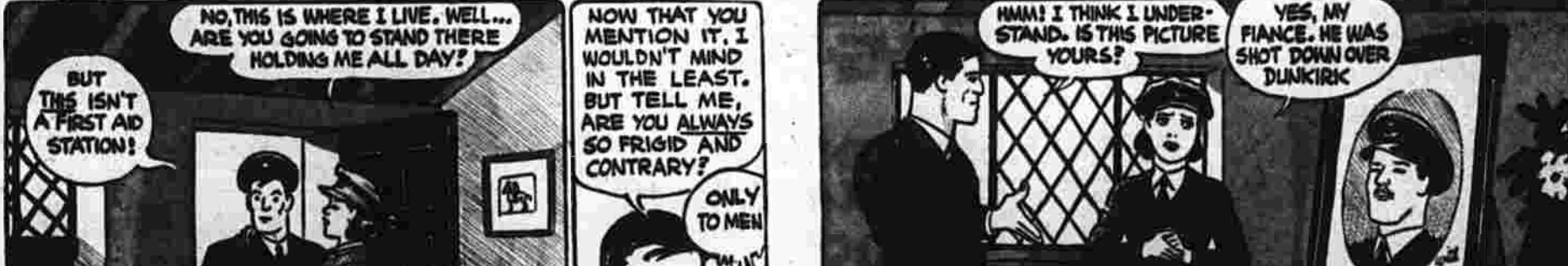
WASH TUBS BY ROY CRANE