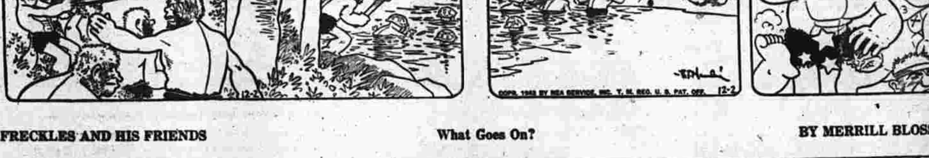
ALLEY OOP BY V. T. HAMLIN